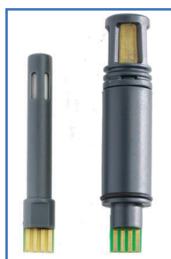
Hygrostick part number POL4750, standard with MMS kit BLD5800LH

The MMS Plus may be used with two styles of interchangeable humidity probe, the Hygrostick and the Humistick.